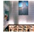
Metal Fabric Tension System