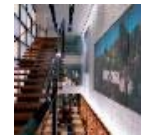
Metal Fabric Wall Panels