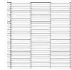
Metal Fabric by Cambridge Architectural