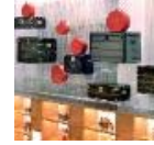
Woven Metal Fabric Panels

105 Goodwill Rd, Cambridge, MD 21613 | Toll free: 866-806-2385 | Fax: 410-901-4979 | sales@cambridgearchitectural.com | Site Map