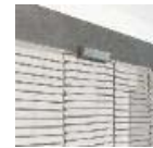
Metal Fabric Attachment Hardware by Cambridge