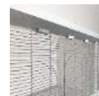
Tensile Structure Made of Metal Fabric