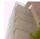
Tensile Structure Made of Metal Fabric