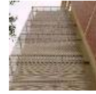
Safety & Security, Hurricane Protection

105 Goodwill Rd, Cambridge, MD 21613 | Toll free: 866-806-2385 | Fax: 410-901-4979 | sales@cambridgearchitectural.com | Site Map