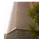
Hurricane Protection System