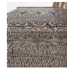
Metal Fabric by Cambridge Architectural