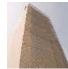
Building Tension System Made of Metal Fabric