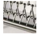
Metal Fabric Attachment Hardware by Cambridge