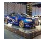
Illuminated Metal Fabric Panels