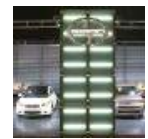
Woven Metal Tension Systems