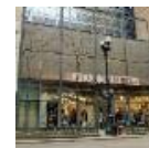
Tensile Structures Made of Metal Fabric