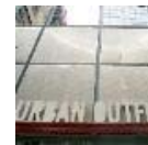
Building Tension System