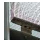
Metal Fabric Attachment Hardware by Cambridge