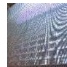
Architectural Mesh Exterior Facade