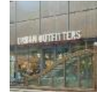
Woven Metal Fabric Panels

Pompei A.D., New York, NY, has designed this and 61 other multi-level "retail environments" for Urban Outfitters, Inc. in North America and Western Europe. Tri-North Builders, Madison, WI, served as the project's general contractor.