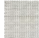
Shade Metal Fabric