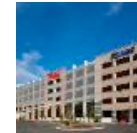
Parking Garage Façade